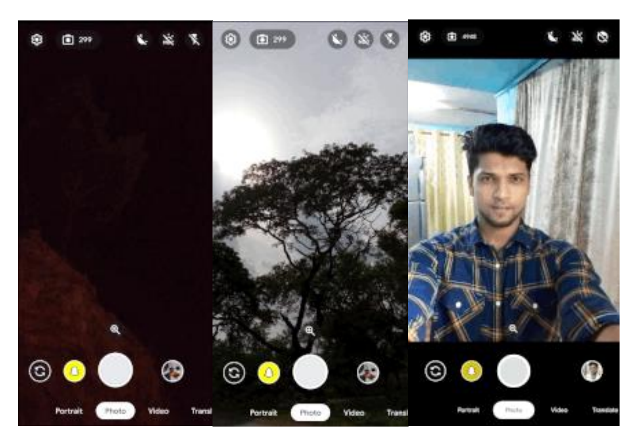
Image 1: Clearer photos in low light with Night mode; Image 2: Photos have wider dynamic range with HDR mode; Image 3: Snapchat Lenses bring Indian-specific effects to your selfies

A great camera: A fast, high-quality camera is a must-have feature for today's smartphone users, so Google and Jio's teams have partnered closely to build an optimized experience within the phone's Camera module resulting in great photos and videos: from clearer photos at night and in low-light situations to HDR mode that brings out wider color and dynamic range in photos, these are firsts for affordable phones in India. Google has also partnered with Snap to integrate Indian-specific Snapchat Lenses directly into the phone's camera, and we will continue to update this experience.